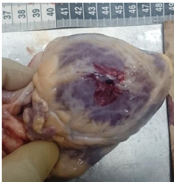
Fig. 2: Partial thickness laceration over lateral wall of the left ventricle.