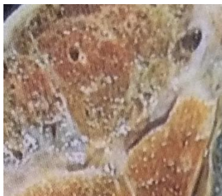
Fig. 1: Macroscopic view of lung