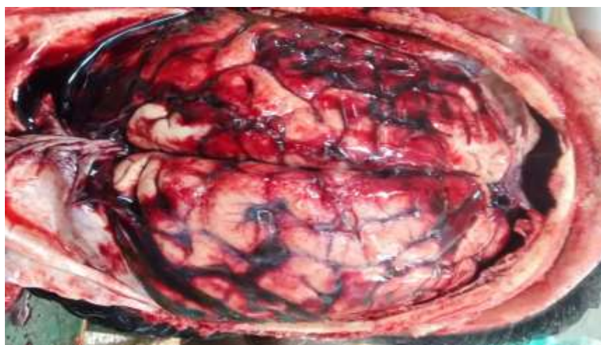
Fig. 3: Diffuse subarachnoid hemorrhage over the cerebrum