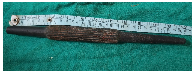
Fig. 4: Wooden roller during weapon examination