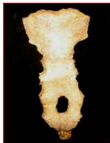
Fig. 5 Sternal Foramina